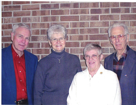
Berean Church Muskegon, MI Prison Ministry Team